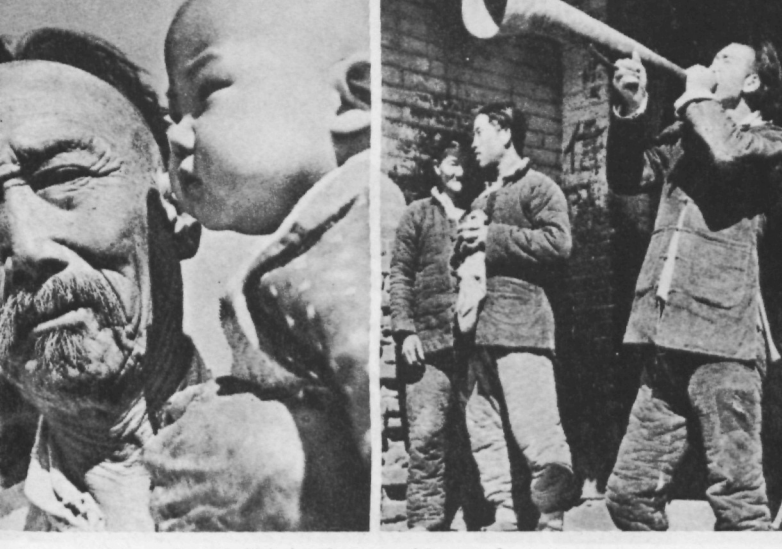
Local Chinese farmer with grandson Town crier calling villagers to the west gate of Yangcheng