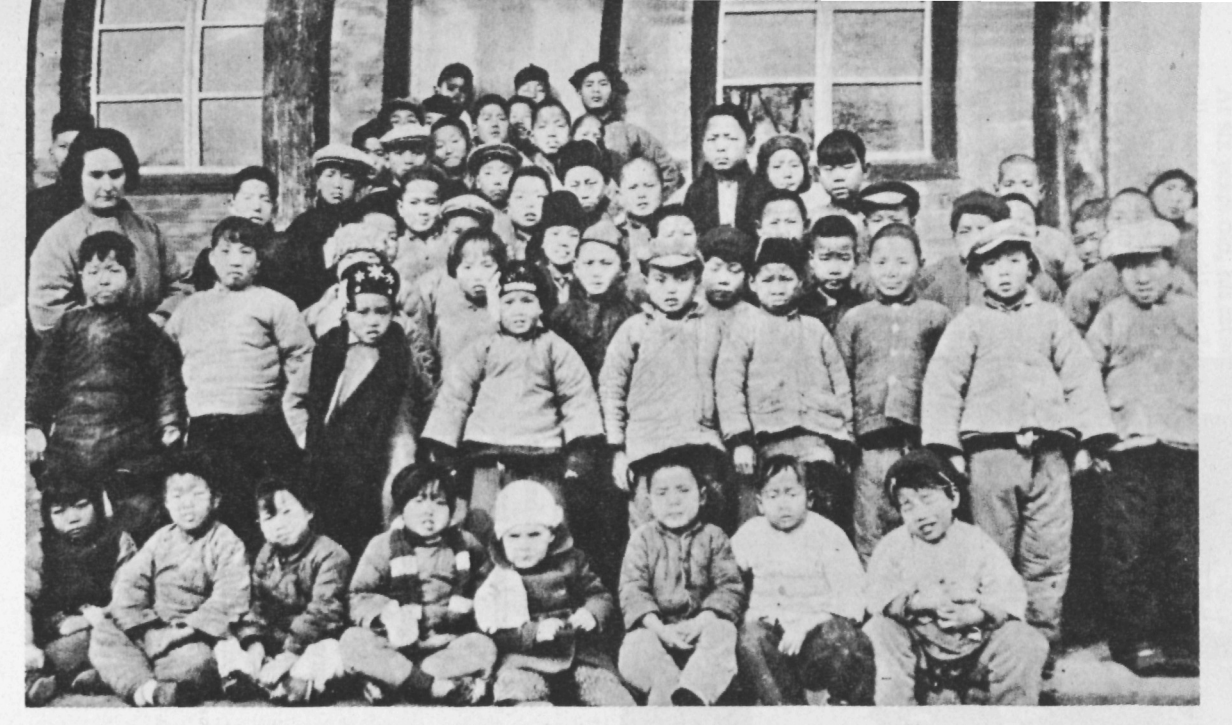
With some of the children before they crossed the mountains to Sian